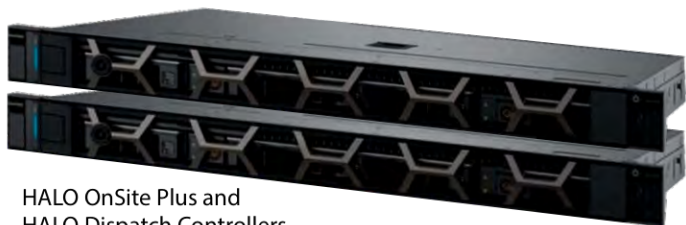
HALO OnSite Plus and HALO Dispatch Controllers

HALO OnSite Plus supports all the features of HALO OnSite and supports an unlimited number of users. HALO OnSite Plus also adds HALO Dispatch, a web-based location tracking and group calling dispatch application (which requires a HALO Dispatch controller). HALO OnSite Plus also supports user-initiated video calls using video-capable PoC devices.