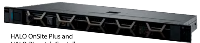
HALO OnSite Plus and HALO Dispatch Controller