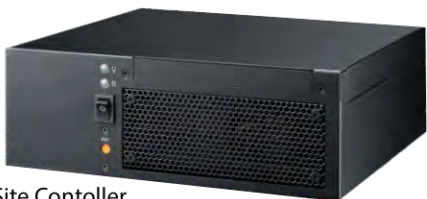
HALO OnSite Controller

HALO OnSite is a low-cost, entry-level system. HALO OnSite supports Wi-Fi and 4G/LTE network access, up to 200 users, group voice calling, and text messaging.