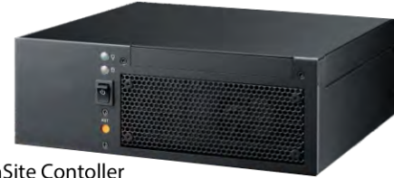
HALO OnSite Controller