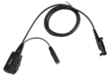
ACN-02 Mic and PTT button with VOX and 3.5mm Jack Receive-only Earpiece (IP54)

External earpieces that are used in combination with the ACN-02