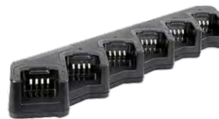
MCL32 6-Radio Multi-Unit Charger