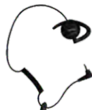
EHS17 ① Receive-Only Adjustable Earhook with Swivel Speaker