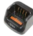
CH10L27 Drop-In Single Unit Charger