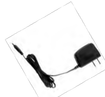
PS1014 Power Adapter