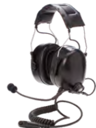
ECN21 Heavy-duty noise-cancelling headset with PTT and boom microphone