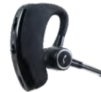
ESW08 Bluetooth Earpiece with PTT button and microphone