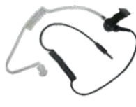
ES-02 Receive-Only Transparent Acoustic Tube