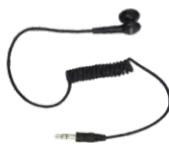
ES-01 Receive-Only Earbud