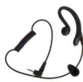
EHS18 ① Receive-Only C-style Earpiece