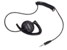
EH-02 Receive-Only Swivel Earpiece