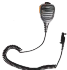
SM26N2 ① Palm PTT Mic with Speaker and emergency button (IP54)