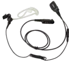
EAN24 Transparent Acoustic Tube Surveillance Earpiece with microphone and in-line PTT button