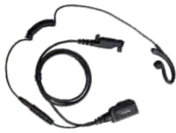
EHN26 C-style Earpiece with microphone and in-line PTT button

External earpieces and microphones that attach directly to the radio