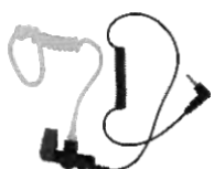
EAS03 ① Receive-Only Transparent Acoustic Tube Earpiece