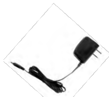
PS1014 Power Adapter