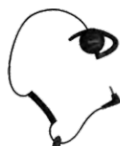
EHS17 ① Receive-Only Adjustable Earhook with Swivel Speaker