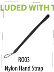
R003 Nylon Hand Strap