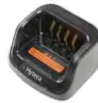
CH10L27 Drop-In Single Unit Charger