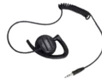
EH-02 Receive-Only Swivel Earpiece