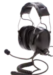
ECN21 Heavy-duty noise-cancelling headset with PTT and boom microphone