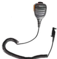
SM26N2 ① Palm PTT Mic with Speaker and emergency button (IP54)