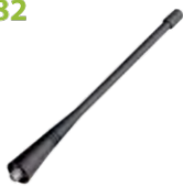
Ships with Standard Long Antenna