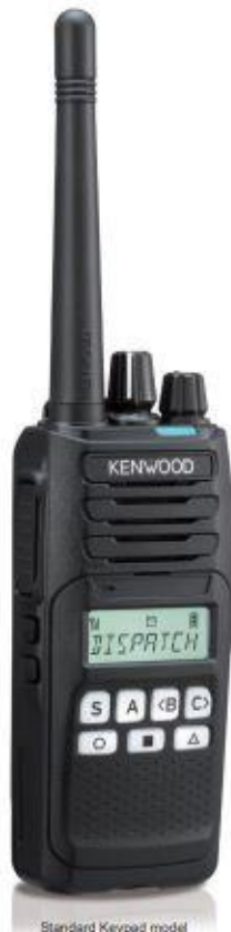
Standard Keypad model

If you are thinking of harnessing the latest digital protocols – NXDN or DMR – to enhance business efficiency or FM analog for its simplicity, the NX-1200/1300 has you covered. Our One-“K”-Fits-All solution offers the widest selection of two-way radios for everyday use. The model matrix also includes basic and keypad variations, with or without a high-contrast backlit LCD. Other features include a 7-color LED indicator and the popular KENWOOD 2-pin audio accessory connector. Plus, mixed-mode operation ensures seamless integration with legacy radios while smoothing the onward migration path to digital. But whatever your specific needs, audio quality is what determines clear voice communications – which is why KENWOOD radios are used under the most grueling conditions, like the cockpit of a racing car. Thanks to our extensive experience with professional systems, reliability is second to none. So whatever your radio requirements, KENWOOD's NX-1200/1300 offers a single platform that's right for you.