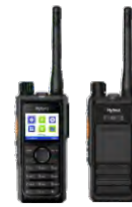
Hytera DMR Two-Way Radios