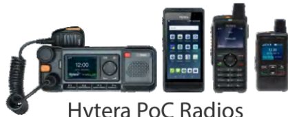
Hytera PoC Radios and Smart Devices